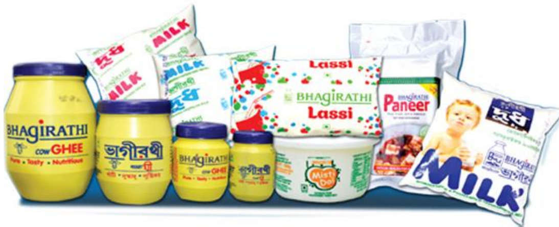
Range of Products of Bhagirathi Milk Union

The Bhagirathi Cooperative Milk Producers' Union Ltd was formed under the "Operation Flood" Program 1974 after the advent of White revolution in our country. The main objective of the Milk Union is to bring about socio economic transformation in the rural masses by organizing Dairy Cooperative across the Murshidabad District. Over a period of 38 years we are trying to infuse a new life in the Cooperative movement in West Bengal, ensuring democratic functioning of the cooperatives such as members' involvement in decision making process, to promote thrift, self-help and mutual aid, involving womenfolk and also to provide for transparent, devoted and efficient management and services relevant to the needs of the cooperatives.